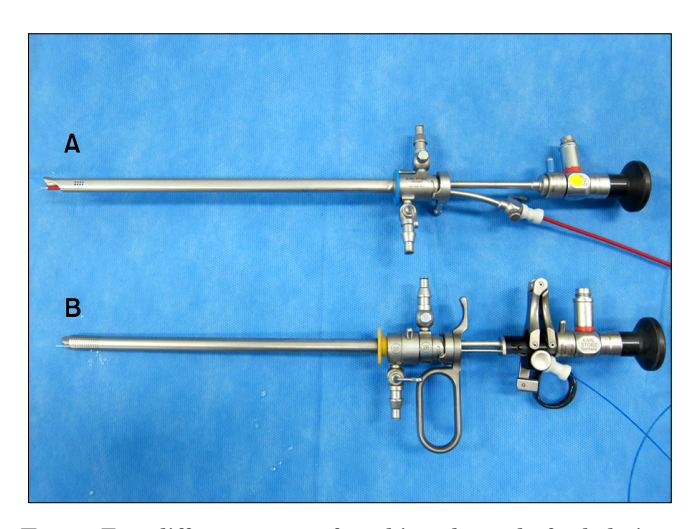
FIG. 1. Two different types of working channels for holmium laser enucleation of the prostate. (A) An Iglesias type resectoscope. (B) A conventional laser fiber stabilizing bridge.

The detailed equipment for HoLEP is similar in all institutional groups [10-13,19,20,22-25,29,38-41]. Generally, HoLEP surgeons use a 60 to 100-W holmium laser (Versapulse, Lumenis Ltd., Yokneam, Israel) with a power setting of 2 to 2.4 J at 25 to 50 Hz [7,10,20,26,39-41]. The 360- to 550- \mu m end-firing laser fibers (SlimLine, Lumenis Ltd.) [7,19,20,22,26,27,40] and 24- to 28-Fr continuous flow resectoscope are routinely used [7,10,26,27,40,41]. In the case of the 24-Fr resectoscope, Hochreiter et al. [27] reported that they did not use a morcellator but used an adjuvant transurethral resection for enucleated adenomas with the "mushroom technique". There are two different